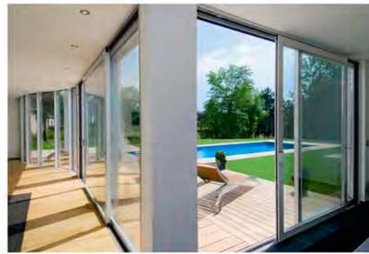
2nr 4m x 2.4m high lift & slide doors