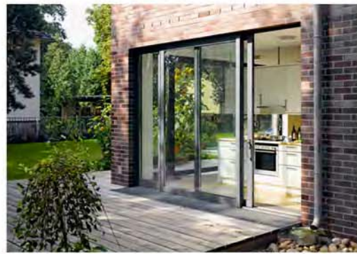
3m wide x 2.5m high lift slide door