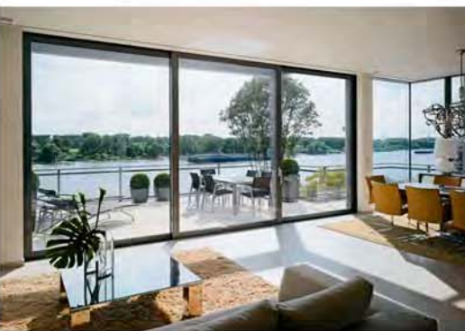
6m wide x 2.4m high, 3 part lift & slide door