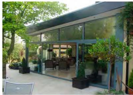
7.5m wide x 2.7m high 4 part lift & slide door with 1m high toplight