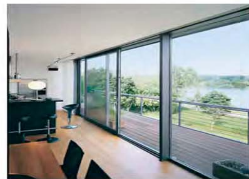
4m wide x 2.2m high lift & slide door with 2m wide sidelight

A lift-and-slide door manufactured by Senator, using the Schüco ASS50 aluminium profile system, is very easy to move. When closed, the door is perfectly weather-tight, providing excellent thermal insulation and sound reduction. Up to three tracks allow large opening widths and the door can therefore be used with great flexibility in large glass construction.